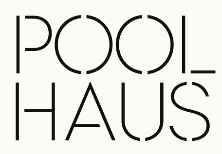
1130 100TH STREET BAY HARBOR ISLANDS, FL 33154